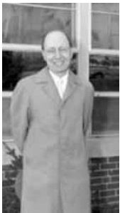
Eugene Wigner

Imaginary numbers also come into play in the study of modern quantum physics. In 1963, Eugene Wigner (1902-1995) won the Nobel Prize in physics for his research in quantum mechanics. He said this about \sqrt{-1} , “... the use of complex numbers is in this case not a calculational trick of applied mathematics but comes close to being a necessity in the formulation of the laws of quantum mechanics.” 2 Given this fact, he responds with this amazing remark, “It is difficult to avoid the impression that a miracle confronts us here.” 3 And again, he ponders, “The enormous usefulness of mathematics in the natural sciences is something bordering on the mysterious and ... there is no rational explanation for it.” 4