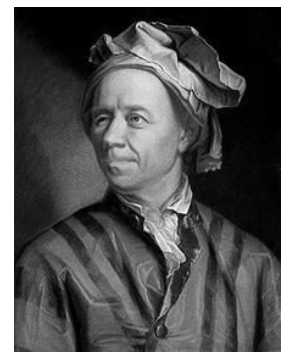
Leonhard Euler

There is one more astounding wonder about imaginary numbers that I would like to explore in this essay. The reasoning I am about to give you was first done by Leonhard Euler (1707-1783), the man of whom it has been said, “As he breathes, he calculates.” If you pay attention carefully, then your reward will be great. I also hope that you will appreciate the ingenious mind that God gave to Euler for not many people in God’s providence are gifted as such.